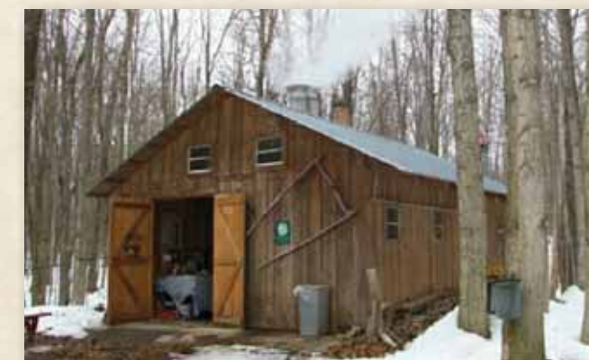
Working Sugar House

Visit the sugar house on the 5th generation family farm where syrup is made and the 'Sweet Magic of Mother Nature' is celebrated. Maple tastings, demonstrations and stories are fun & educational for 'kids of all ages' during Maple Weekend in March. Maple products sold year round.