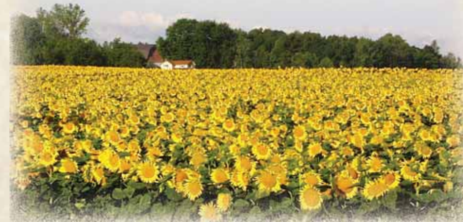
Golden Fields of Sunflowers by Wendi Pencille