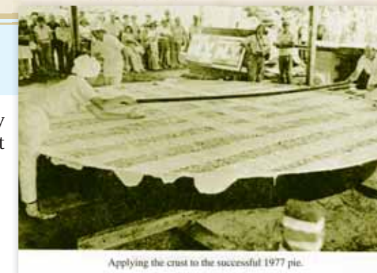
Applying the crust to the successful 1977 pie.

Providing research-based education in: Agriculture • 4-H Youth Development • Horticulture Connection to Relevant Resources