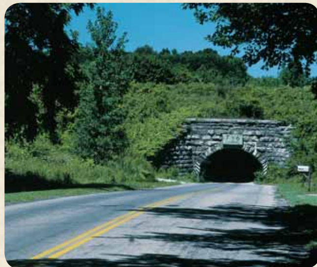
The Culvert under the Erie Canal, courtesy of Arthur Barnes

Lake Ontario Sport Fishing Promotion Council www.ilovenyfishing.com