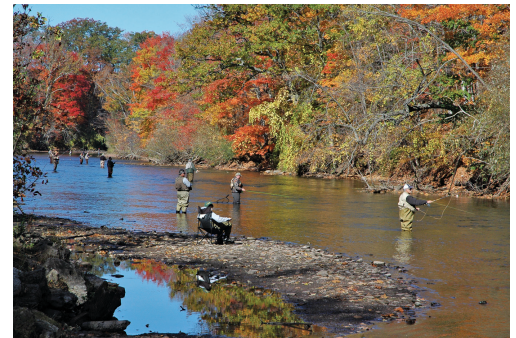
Fly Fishing on the Oak Orchard River

In the Oak Orchard River and nearby tribs like Johnson Creek and Sandy Creek during the fall, winter and spring, the trout and salmon make upstream migrations where guides and anglers cast and make hopeful drifts. The salmon and trout follow the cool flowing tribs and grow to trophy size. The fish are strong fighters awaiting your offering of lure, spoon, fly or bait.